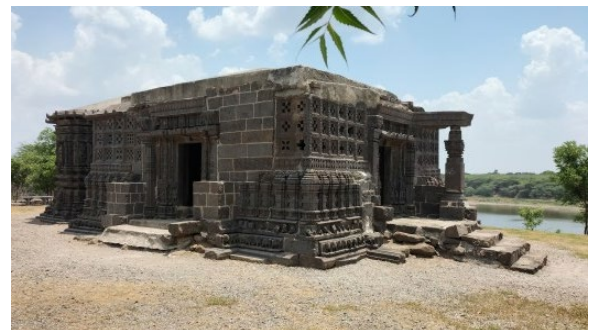
Fig. 1. Visual of the Lakshmi Narayan Temple showing exterior form (Under ASI Conservation)

This study evaluates the impact of heritage tourism on rural settlements through the case of Pedgaon. The research examines how heritage assets can contribute to economic growth, social development, cultural preservation, and infrastructure enhancement while identifying the challenges associated with heritage-led development.