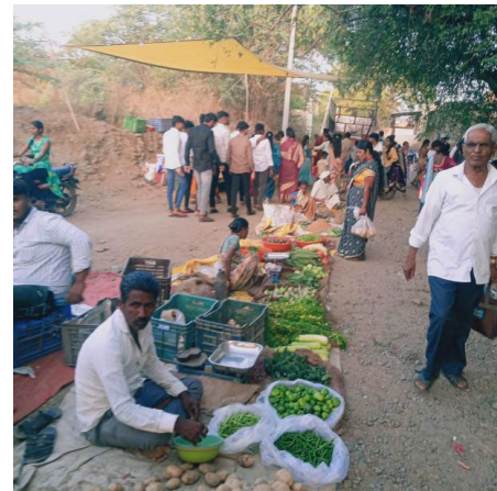
Fig. 4. Community marketplace reflecting local economic and cultural activities in Pedgaon for tourism

However, these challenges also present opportunities. Heritage documentation, community participation, tourism circuit development, interpretation centres, cultural events, and stakeholder collaboration can transform Pedgaon into a model of heritage-led rural development. The integration of heritage conservation with tourism planning can contribute to both cultural preservation and economic growth.