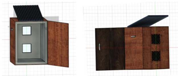
Fig. 1. 3D model of solar-powered thermoelectric refrigerator